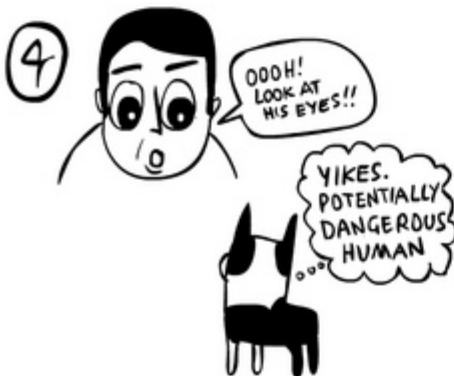
DON'T Stare him in the eye (This is an adversarial gesture)