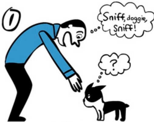
DON'T Lean over the dog & stick your hand in his face

Most people do this stuff and it stresses dogs out so they BITE! I don't care how cute you (or your kid) think Boogie is. Please show him some respect.