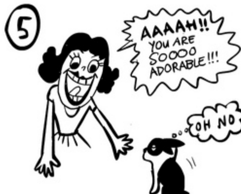
DON'T Squeal or shout in his face