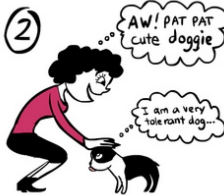
DON'T Lean over the dog & stick your hand on top of his head