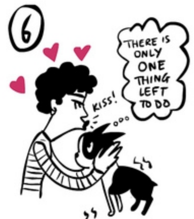
DON'T Grab his head and kiss it (This is an invasion of space)

Doing this to a dog who doesn't know you is like a perfect stranger giving you a great big hug and kiss in an elevator. Wouldn't that creep you out? And wouldn't you have the right to defend yourself?