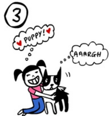
DON'T Grab or Hug him