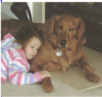
SEAMUS (WHOSE RESCUE NAME WAS SHANE) MAKES A GOOD PILLOW FOR A NAP.