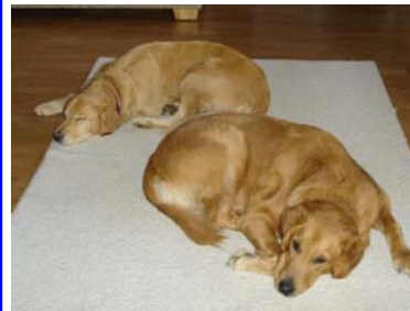
RIVER HAD A HARD LIFE BEFORE COMING TO RESCUE. HE IS NOW BLOSSOMING IN HIS NEW HOME AND TAKES A NAP WITH HIS NEW DOGGIE BROTHER, JAKE AFTER A BUSY DAY.