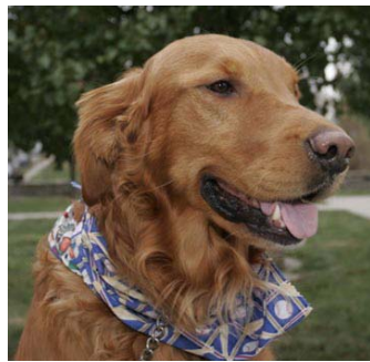
DODGIE STRIKES A HANDSOME POSE.